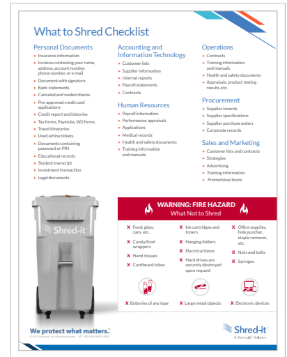
Fire Hazard/ What to Shred Poster